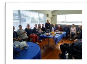
Stroke Central thank Kapiti Volunteers